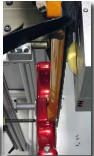
No matter if nickel silver or stainless steel: The Plek cuttermodule can dress frets to an accuracy of 1/100 mm.

In closing the frets are polished and intonation is set.